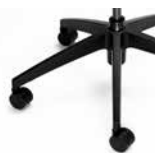
Black Nylon (BLK)