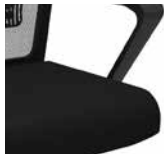
Black Fabric (SBFI)