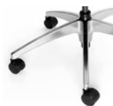
Polished Aluminum (ALM)