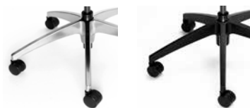
Polished Aluminum (ALM)