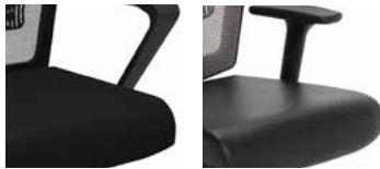
Black Fabric (SBFI)