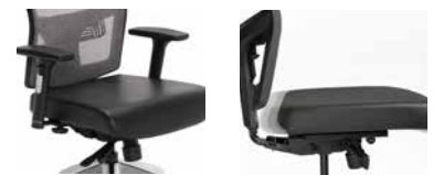
Swivel Synchro Tilt Control (SY)