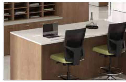
Canvas + Gesso Work Tables

Seamless integration can be found across our entire portfolio for technology without distraction.