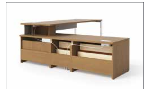
Canvas + Gesso