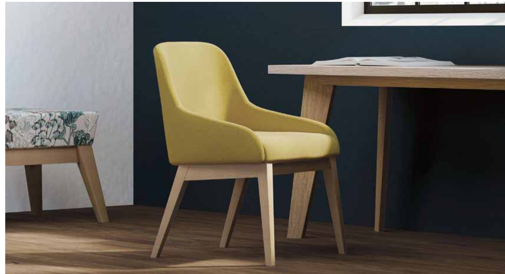
Spiced Walnut (SSSPW)