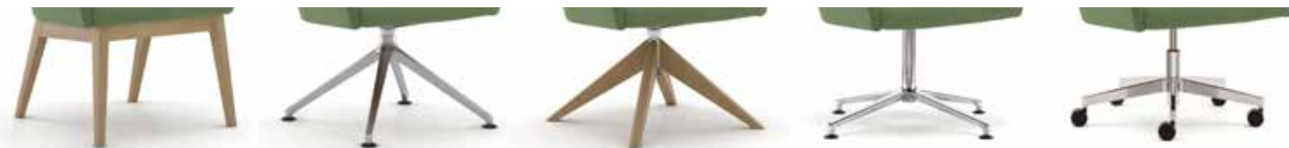
4-Leg Wood Base (SN4L) 4-Star High Polished Aluminum Swivel Base w/Glides (SL4SA) 4-Star Wood Swivel Base: Blonde Oak (SSBO) or Spiced Walnut (SSSPW) 4-Star Low Polished Aluminum Swivel Base with Glides (SS4SA) 5-Star Polished Aluminum Swivel Base with Pneumatic Height Adjustment on Casters (SS5SA); with Auto Return on Glides (SS5SARA)