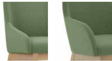
SN30C Armless SN40C Arms