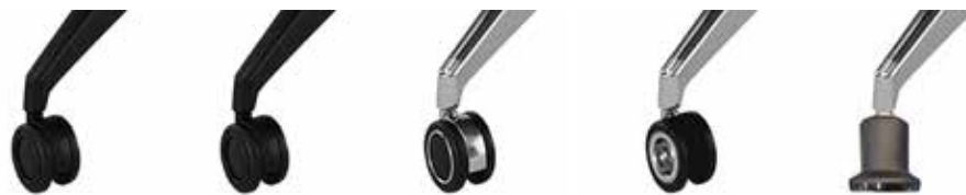
Black Dual Wheel Carpet Caster (BCC) Black Soft Wheel Caster (BHC) Chrome-Rimmed w/ Roll Control (CHRC) Chrome Caster (CASTC) Black Glides for All Surfaces (BG)