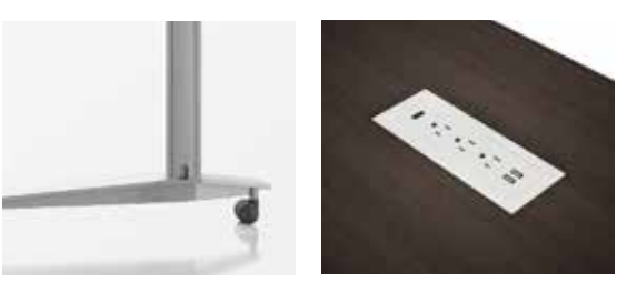
Stylish, Envy C-legs route wires to the legs where a discreet removable interior panel keeps things tidy while providing access. Specify power ports in or under the work surface. Ports are available in white, aluminum, or black. Refer to the Tri-One price list to see all of the wire management and power options available.