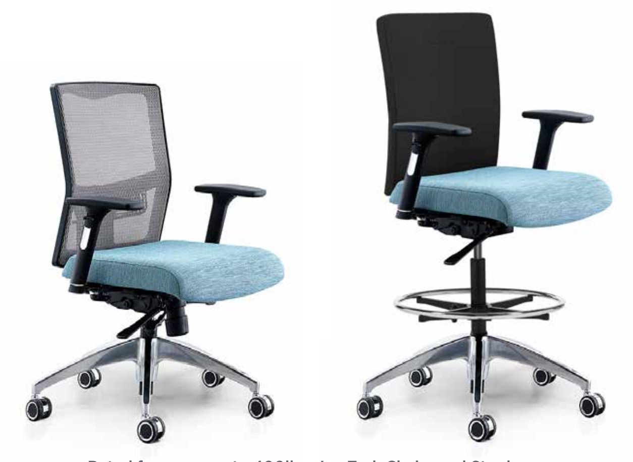
Rated for users up to 400lbs, Joy Task Chairs and Stools are the natural go-to for a diverse range of people and environments.