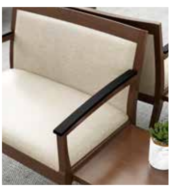
Arm Caps: Optional black polyurethane arm caps are available on all Gleem+ models, allowing you to protect the wood finish and increase the lifespan of the chair.