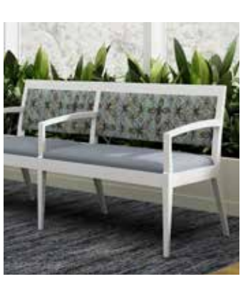
High Occupancy + Bariatric: Each seat within the Gleem+ series accommodates users up to 400lbs, while Gleem+ Bariatric seats accommodate users up to 600lbs.