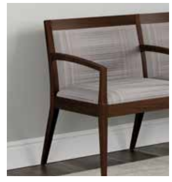
Wall Saver Design: Every Gleem+ chair comes standard with an integrated wall saver design, helping to eliminate mars and wall scratches within your spaces.