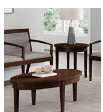
Ganging + Freestanding Tables: Gleem+ offers a range of ganging and freestanding tables to provide additional functionality and complete the spaces throughout your facilities.