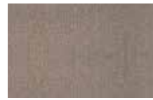
Weathered Ash (WTA)*