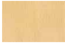
Sugar Maple (SM)