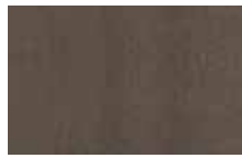
Portico Teak (PTK)*