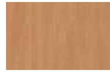
Harvest Maple (HVM)*