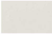
White Nebbia (WNB)