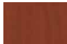
Select Cherry (SCH)