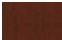
Dark Cherry (DC)