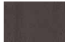
Smoky Brown Pear (SBP)*