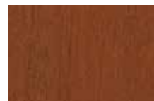
Williamsburg Cherry (WC)