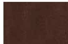
Columbian Walnut (CO)*