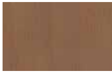
River Cherry (RC)*