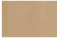
Oak Riftwood (ORW)*