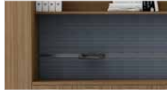
Specify fabric and/or dry erase work walls with a range of accessories and trays.