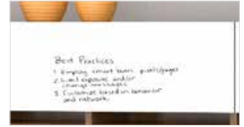
Add style and function with high-gloss acrylics and dry erase boards on doors.