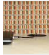
Wire management and power/data options allow users clean, easy access.