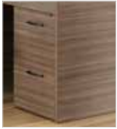
Choose vertical or horizontal grain direction on a variety of components.

A foundational suite of casegoods primed to evolve with your needs. Gesso allows you to combine luxurious veneers, laminates and other materials to create stylish, reconfigurable workspaces.