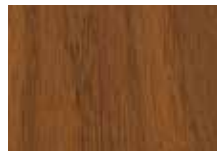
Artisan Walnut (AW) Seating