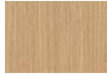
Oak Riftwood (ORW)* HPL, Seating