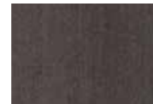
Smoky Brown Pear (SBP)* HPL, Seating