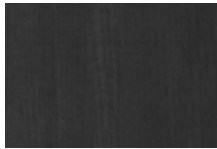
Metropolis Sky (MTS) Seating