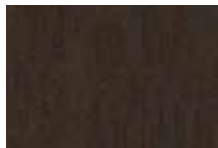
Dark Forest Walnut (DFW)* Seating