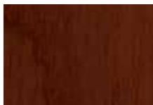
Dark Cherry (DC) Seating