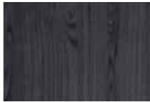
Midnight Run (MNR) HPL, Seating