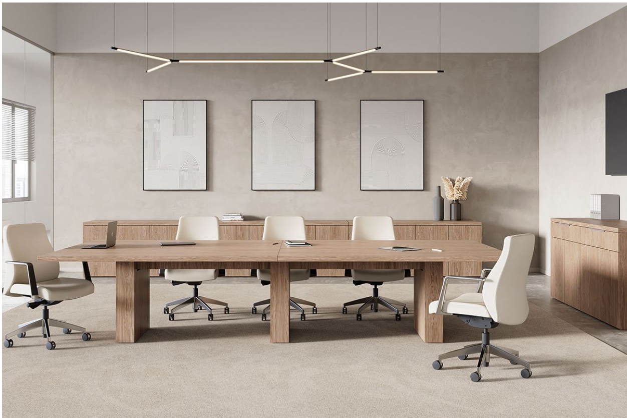
Indiana Furniture's Catalyst table with Rockstar Headliner mid-back task chairs

Considered an agent that provokes significant change in workplaces, Indiana Furniture creates products to meet users' needs and bring designers' visions to life. As such, the company expands its product portfolio at NeoCon 2023 with Catalyst and Strut tables, Rockstar and Gleem+ seating, eight new laminates, and four new veneers, all of which offer the flexibility to integrate and effectively complement each other to form a complete solution to the ever-changing needs of the post-COVID world.