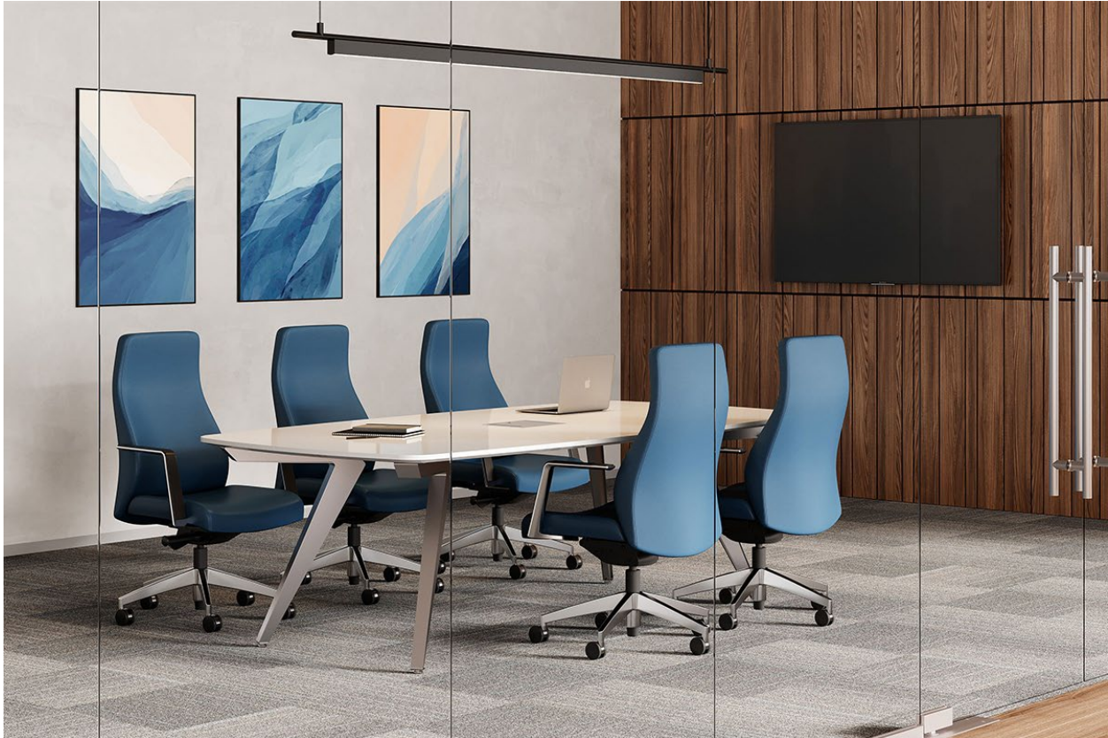
Strut table with Rockstar chairs

A striking table like Strut deserves a complementary seating option that's equally buzzworthy. And that's where Rockstar comes in. Although Indiana Furniture introduced the Rockstar chair several years ago, the company fine-tuned the product and is now releasing the Roadie and the Headliner versions of task seating. With both chairs featuring sleek contours, weight-activated controls, and several back, arm, base, and caster options, Rockstar Roadie is a paired down model that doesn't sacrifice comfort for its slim design, and Rockstar Headliner is the executive chair version of plush luxury. These two new and improved models of Rockstar have been enhanced with ergonomic improvements that satisfy a range of body types for all-day comfort.