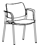
Upholstered Seat+Back with Arms: 910U