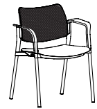
Upholstered Seat and Mesh Back with Arms: 910M