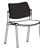
Upholstered Seat and Mesh Back Armless: 900M