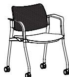
Upholstered Seat and Mesh Back with Arms and Casters: 918M