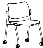
Upholstered Seat+Back Armless with Casters: 908U