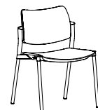
Poly Seat+Back Armless: 900P