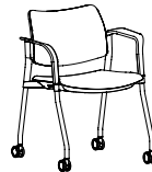
Upholstered Seat+Back with Arms and Casters: 918U