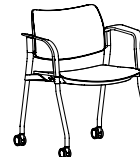
Poly Seat+Back with Arms and Casters: 918P