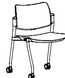
Poly Seat+Back Armless with Casters: 908P