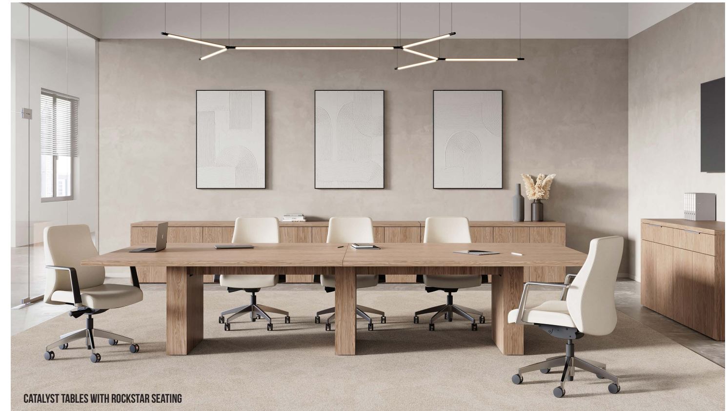
CATALYST TABLES WITH ROCKSTAR SEATING

Welcome to the stage the new Rockstar Roadie and Rockstar Headliner task chairs. Rockstar Roadie brings you a slim design with big comfort, while Rockstar Headliner steals the show with an ultra-thick, sink-into-it design perfect for individual workspaces, meeting rooms, and more. Launching in June, the one-of-a-kind comfort of Rockstar is sure to debut at the top of the charts.