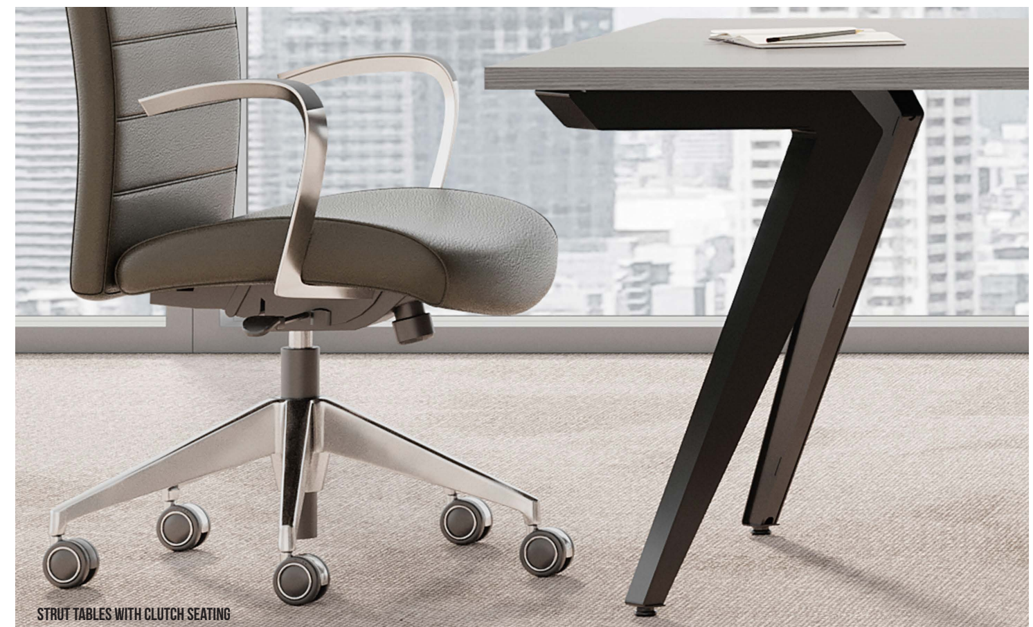
STRUT TABLES WITH CLUTCH SEATING