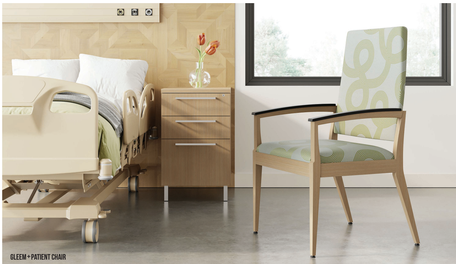
GLEEM + PATIENT CHAIR