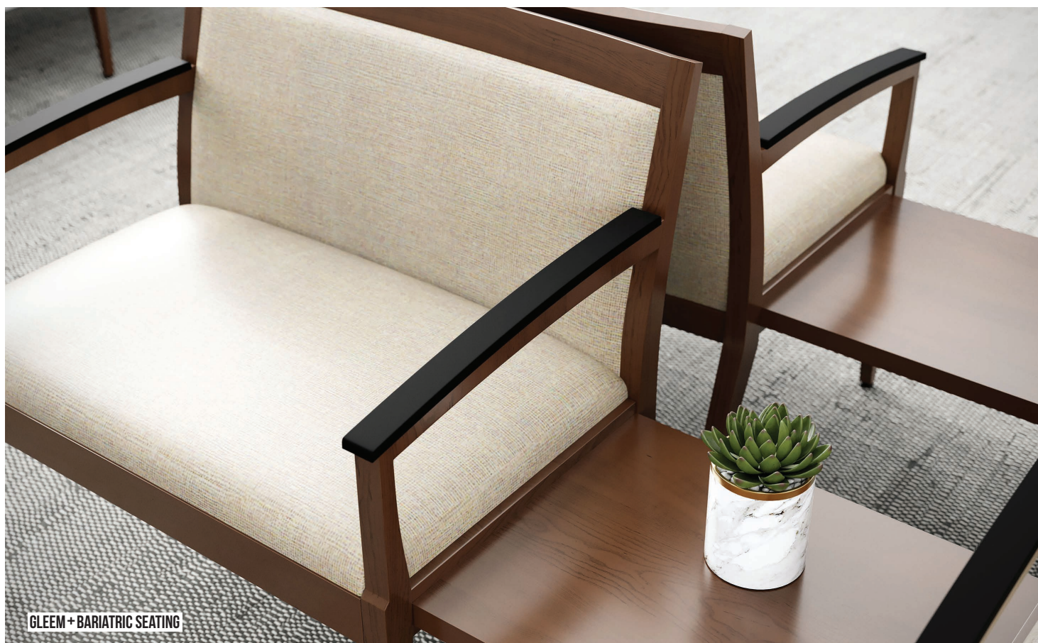
GLEEM + BARIATRIC SEATING