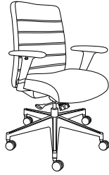
582: Mid Back