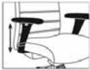
ABT2: Black Height Adjustable T