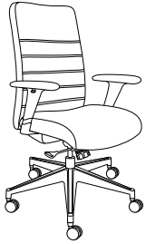
584: High Back

Clutch is designed to fit your exact need. Choose the height that fits the environment, the arm that supports the task, and the base that works best for the project. Contoured lumbar support and flexible suspension provide all day comfort. A selection of arm and base styles offer the right adjustment.