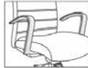
FAL1 Aluminum Fixed Loop