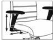
ABT2W: Black Height and Width Adjustable T