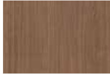
River Cherry (RC)* HPL, Seating