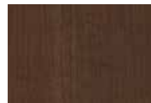
Henna Walnut (HNW) Seating