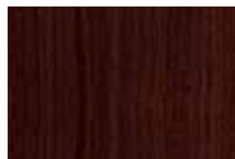
Mahogany Walnut (MW) HPL, Seating