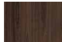
Sepia Walnut (SPW)* HPL, Seating