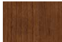
Shaker Cherry (SKC) HPL, Seating