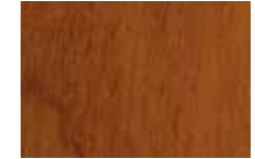
Golden Cherry (GC) HPL, Seating