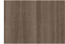
Studio Teak (TK) HPL, Seating