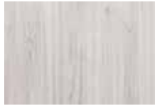
White Nebbia (WNB) HPL, Seating