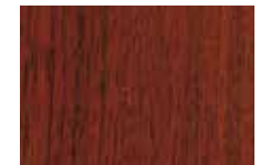
Harvest Walnut (HW) Seating