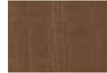
Pinnacle Walnut (PNW) HPL, Seating