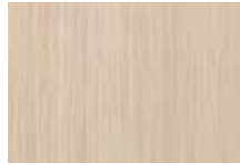
Beigewood (BW)* HPL, Seating