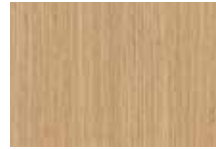
Oak Riftwood (ORW)* HPL, Seating