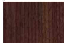
Columbian Walnut (CO) HPL, Seating