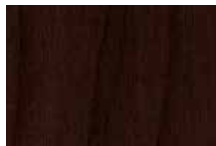
Espresso (EW/EF) HPL, Seating