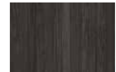
Asian Night (AS) HPL, Seating