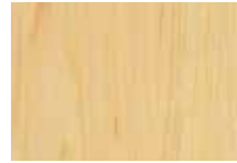
Sugar Maple (SM) HPL