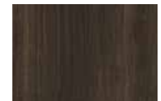
Florence Walnut (FLW)* HPL, Seating