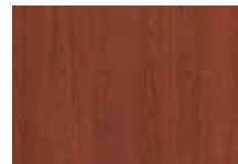
Select Cherry (SCH) HPL, Seating