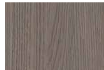
Weathered Ash (WTA)* HPL, Seating