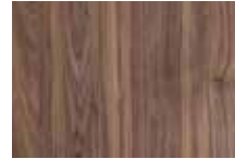
Natural Marrone (NTM)* HPL, Seating