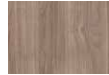
Kirsche (KHE) HPL, Seating