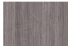
Portico Teak (PTK) TFL, HPL