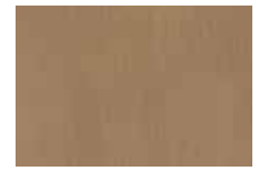
Fawn Oak (FO) Veneer*