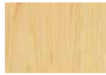
Sugar Maple (SM) Veneer, TFL, HPL