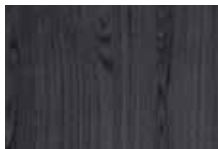
Midnight Run (MNR) TFL, HPL