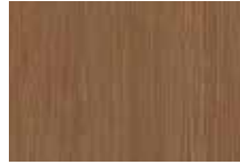
Mesa Sunset (MAS) Veneer*