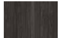
Asian Night (AS) Veneer, TFL, HPL